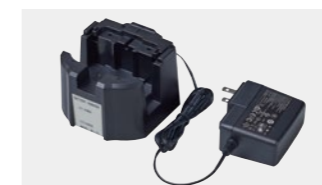
• Battery charger [BC-10]