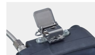
• Alligator clip [ST-22]