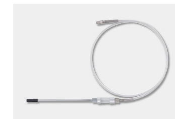
• Gas sampling tube (1m/2m/3m/5m/10m) For normal [SH-301] For solvent gas [SH-401] *Photo shows 1m tube for solvent gas