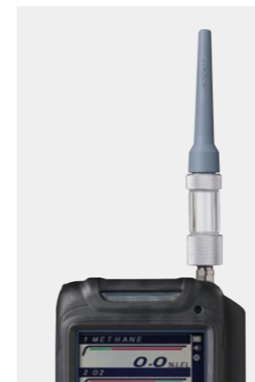
• Attachment (short probe) [AT-2B]